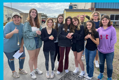
Our Coastal Plains Chicken Project began on February 16. This year we welcomed new 4-H'ers as well as Croatan and West Carteret High School agriculture students to the program.